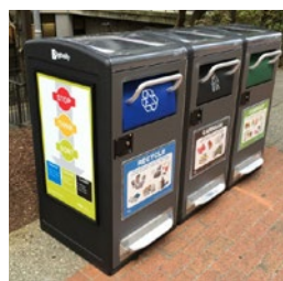
Photo Credits (clockwise) Water Efficiency Pays Off — Robert Hood Electric Transit Bus — Derrick Tyler 100 Mile Biking Team — Captivating Sports Photos Big Belly Solar Receptacles — Gail Lee