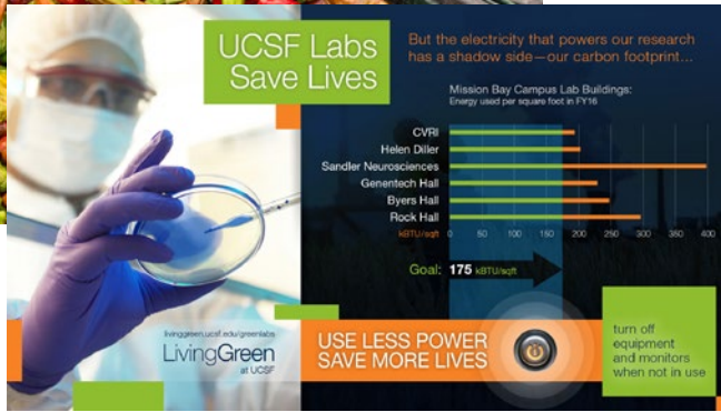
UCSF Farmers' Market Green Labs & Climate Changes Health Poster Campaigns Electric Car Charging Station